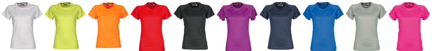
WHITE FLUORESCENT YELLOW FLUORESCENT ORANGE RED BLACK SUMMER VIOLET NAVY BLUE ROYAL BLUE LIGHT GREY FLUORESCENT FUCHSIA